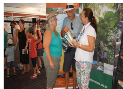
Melbourne Caravan & Camping Show

Page 2 Melbourne Caravan & Camping, Calls for Tender, Mission Beach Charters – something for Everyone!