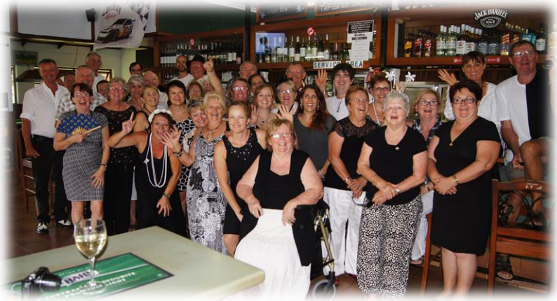
The Winning Team from MBBT