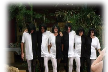
Don't Give Up Your Day Job!