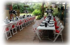
Perfect tropical backdrop

The black and white theme was a perfect accompaniment for the tropical backdrop at the old Queensland Hotel.